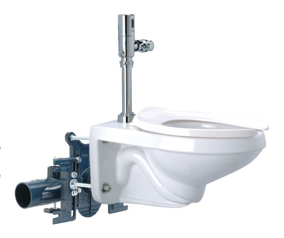
High efficiency toilet and carrier system

Originally performed in massive Excel spreadsheets, the ZPDP required creative configurations and scripts within PLM 360 to fulfill the ZPDP requirements. Advanced Solutions' PLM team took the lead on development of the site content and scripts, while its software development team created any necessary interfaces with external systems. Advanced Solutions allowed Zurn to continue its business as usual, minimizing impact during the development of the new PLM system. ASI PLM subject matter experts understood the process quickly and anticipated challenges and solutions before they even came into play. "The team was committed to the project,